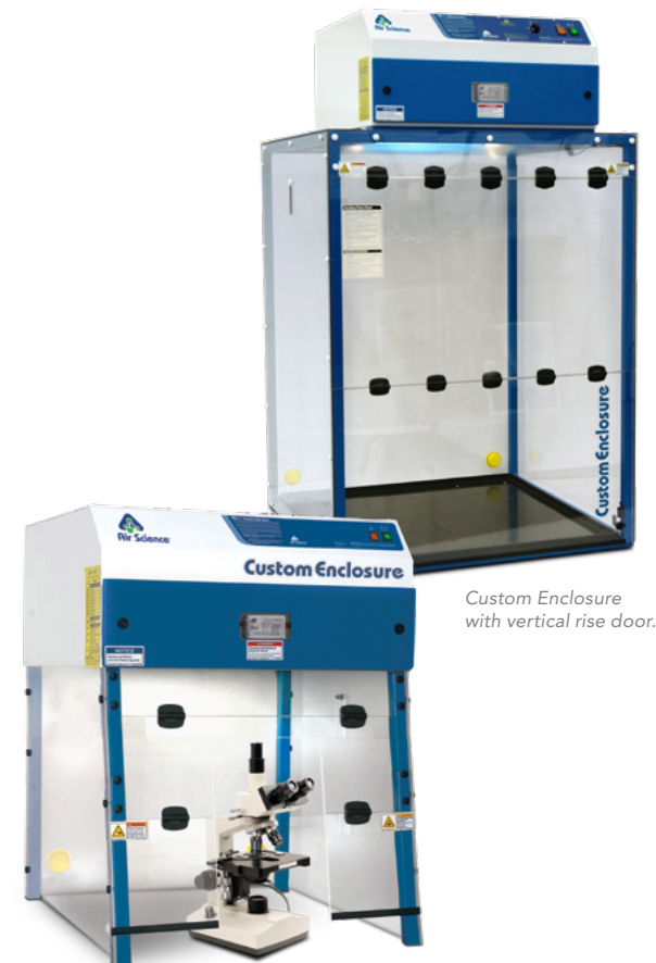
Custom Enclosure with vertical rise door.