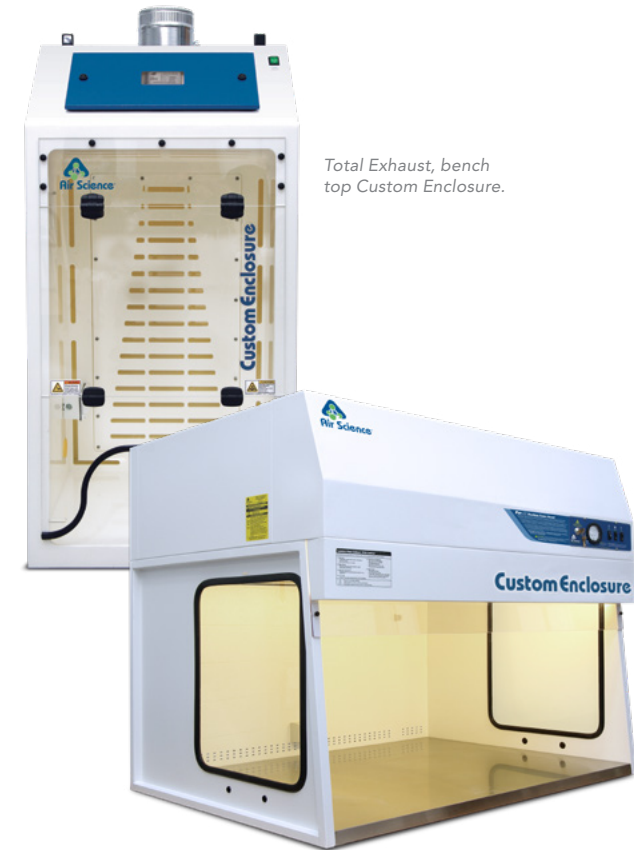
Total Exhaust, bench top Custom Enclosure.