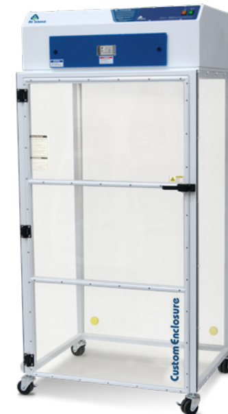
Tablet Press Enclosure